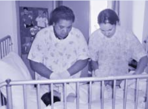
C3West nursing staff with a patient

In this month's column, we are pleased to be able to provide you with a brief introduction to our General Medicine Ward (with Isolation facilities), which is also known as C3West.