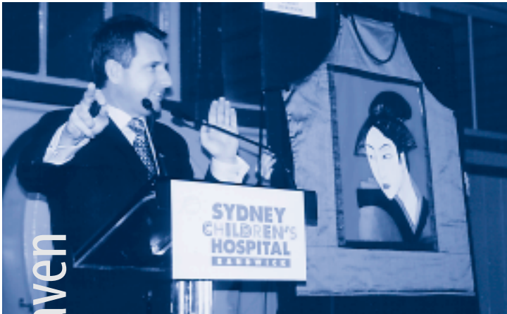
A "Pinnie" going under the Hammer

They will all be taking part in an event called 'Pinnies' from Heaven on Thursday, 27 March 2003 at Newmarket Stables, William Inglis and Son, Young Street, Randwick to benefit Sydney Children's Hospital, Randwick.