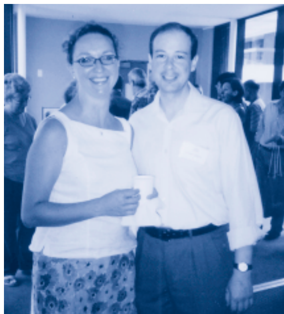
Participants at the recent GP Symposium