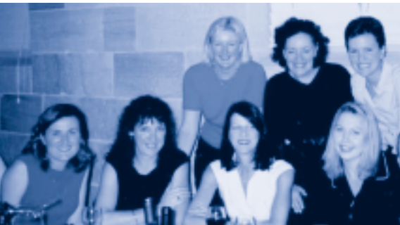
SCH, Randwick nursing staff enjoying last year's International Nurses Day