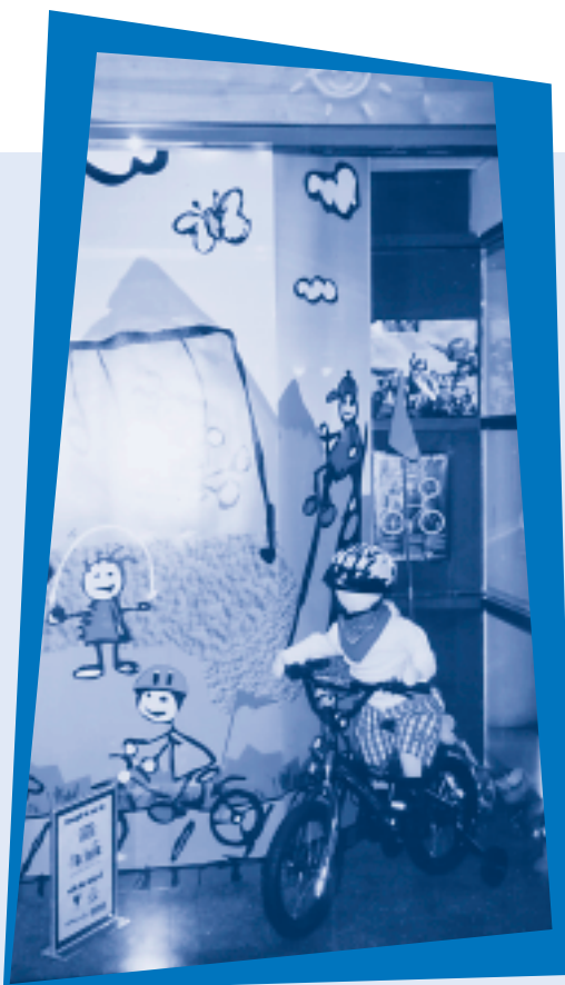
The Bike Safety Health Promotion Window Display

This window display is an initiative of the Health Promotion Committee and has been supported by Kidsafe. The RTA has provided additional resources. Child mannequins were donated by Downtown Duty Free. The latest display features water safety with Royal Life Saving Australia providing additional resources. A competition with the chance to win sun safety suits will start in February.