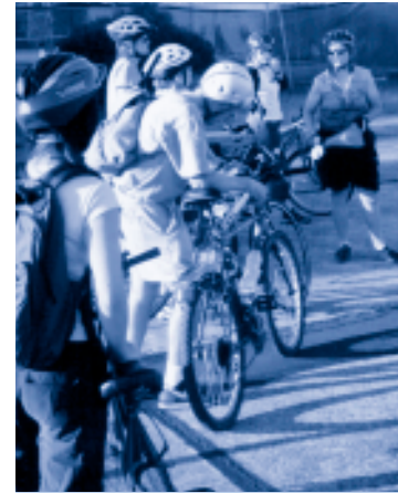
Participants at a cycling skills course