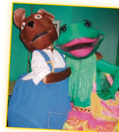
Roo and Liz at SCH

They certainly helped brighten everyone's day!