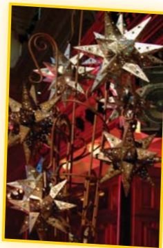
Two of the exciting Trees - the Austereo and the Accoutrement Tree