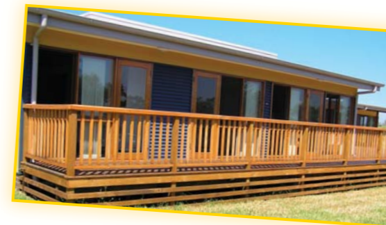
The new La Perouse Community Health Centre

It aims to be a culturally appropriate referral and drop-in centre operated through a collaboration of staff from Sydney Children's Hospital (SCH), Prince of Wales Hospital (POW), the Royal Hospital for Women, Sydney/Sydney Eye Hospital and the Aboriginal Medical Service at Redfern.