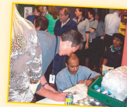
Staff members completing their questionnaires