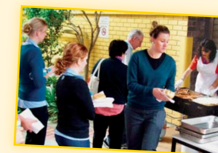
Staff enjoying the BBQ