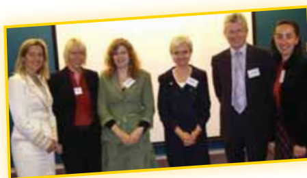
Members of the SCH EB team with Great Ormond St Hospital staff

Held at St George Hospital, and attended by a number of national and international visitors, the successful conference provided staff with the opportunity to share research and clinical skills.