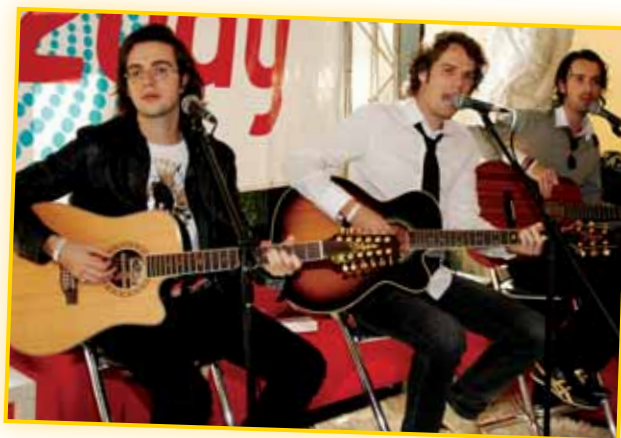
Evermore perform live at the 2dayFM Gold Week outside broadcast