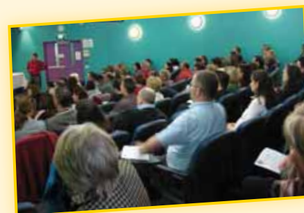
Kids Cancer Update guests