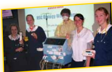
Year 12 students from St Scholastica's Glebe and St Mary's, Gunnedah (near Tamworth) explore clinical equipment.

For more information about school excursions please contact the Health Education Unit on 9382 1855.