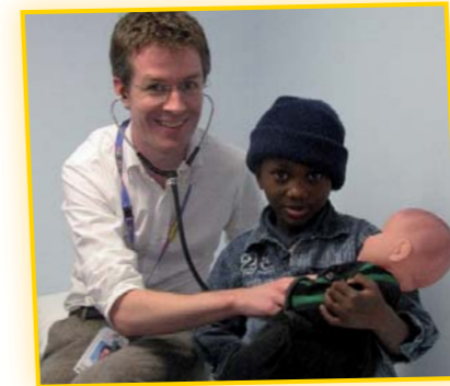
Refugee clinic staff with their first patients

problems reflecting the epidemiology of their countries of origin and of refugee camps in transit countries. Refugee children have high rates of infectious diseases (Hepatitis B, latent tuberculosis and schistosomiasis), incomplete or delayed immunisation, growth and nutrition problems, poor dental health as well as psychological health problems.