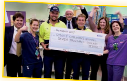
Sydney Water makes their presentation

On 3 August, representatives from Sydney Water toured the emergency department and presented the Hospital with a cheque for $7,000, which was raised through their safety program. Sydney Water and their contractors acknowledge employees who maintain safety standards, by donating funds to chosen charities. The donation will fund a nursing scholarship in the emergency department. Thank you to Sydney Water and all their safety-conscious employees for this generous donation.