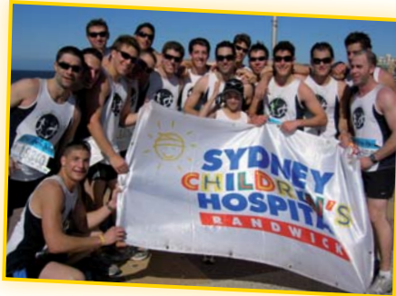
One of the fundraising groups, Team Stretcher at the finish line, flying the SCH flag!

We were overwhelmed with the commitment of staff and other Hospital supporters who came from far and wide to compete in the race and support SCH! We look forward to your support again in 2008.