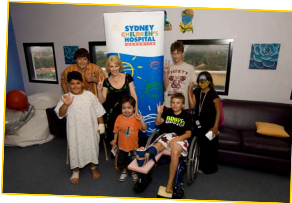
Kylie Minogue with patients

We wish Ms Minogue every success for her upcoming world tour, and hope to have her visit the Hospital again very soon!