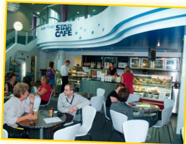
The 'new look' Star Café sponsored by BigPond

THERE have been some exciting changes to the Star Café over the Christmas closure. BigPond, the new sponsor of the Star Café, have created a fresh new look with internet terminals set up for general use. Thank you to BigPond for their support of the Star Café and helping it become such a special place for families, visitors and staff to meet.