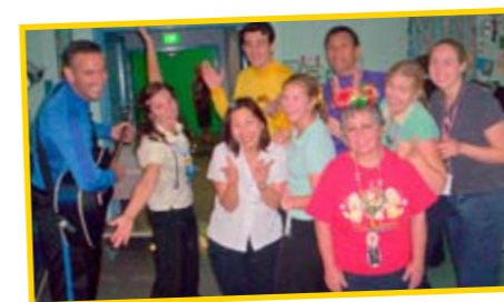
The Wiggles drop by on Christmas day.

A big 'thank you' to The Wiggles. SCH patients, family and staff certainly appreciate their ongoing support and generosity.