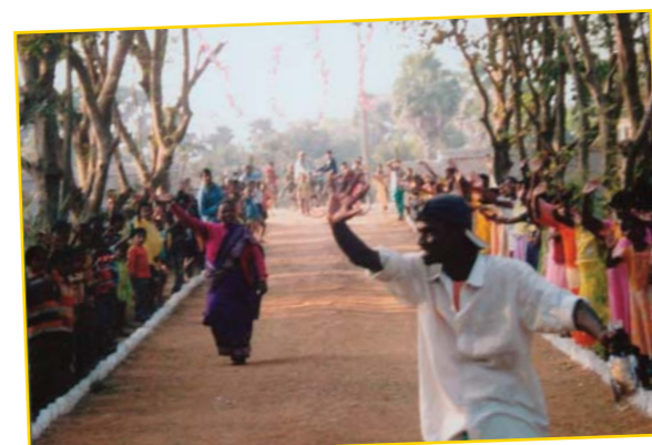
Travels through India - a memorable moment: on leaving the ashram/boarding school, the staff and students held an honour for the first visit by a doctor in over 12 months