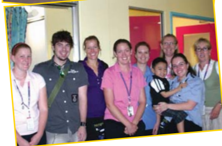
Official opening of the new look C2 South