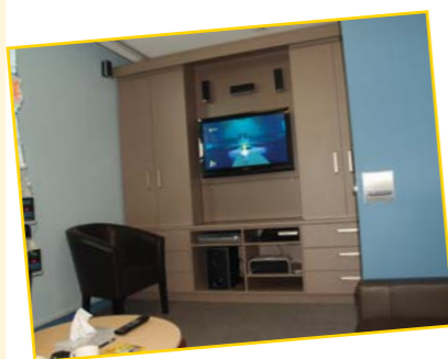
Changing rooms – the new conference/adolescent room in C2 West

THE beginning of March saw the official opening of C2 West's new conference/adolescent room.