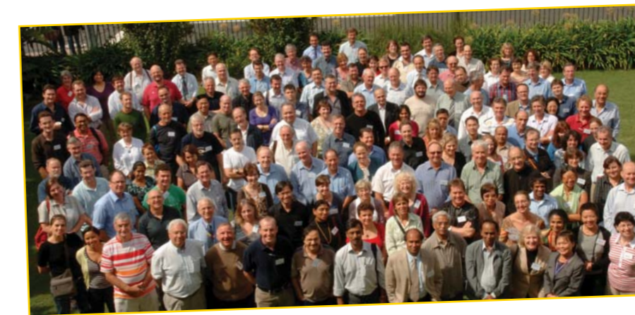
Paediatricians at the SCH 25th Annual Course in Paediatrics