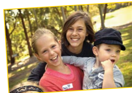
SCH patients bond at the Children's Crohns and Colitis camp