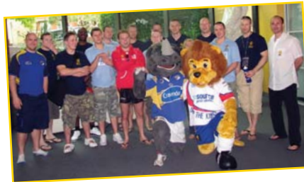
Above: The Great Britain Police Rugby League team stop by SCH with their mascot 'Alfie'